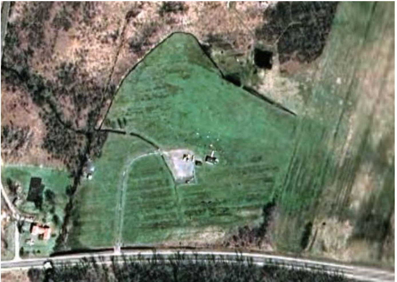
STARS Field Satellite photo